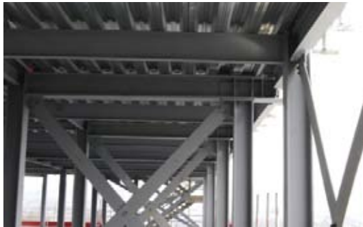
Above: Bracing has been positioned in lift shafts and partition walls.